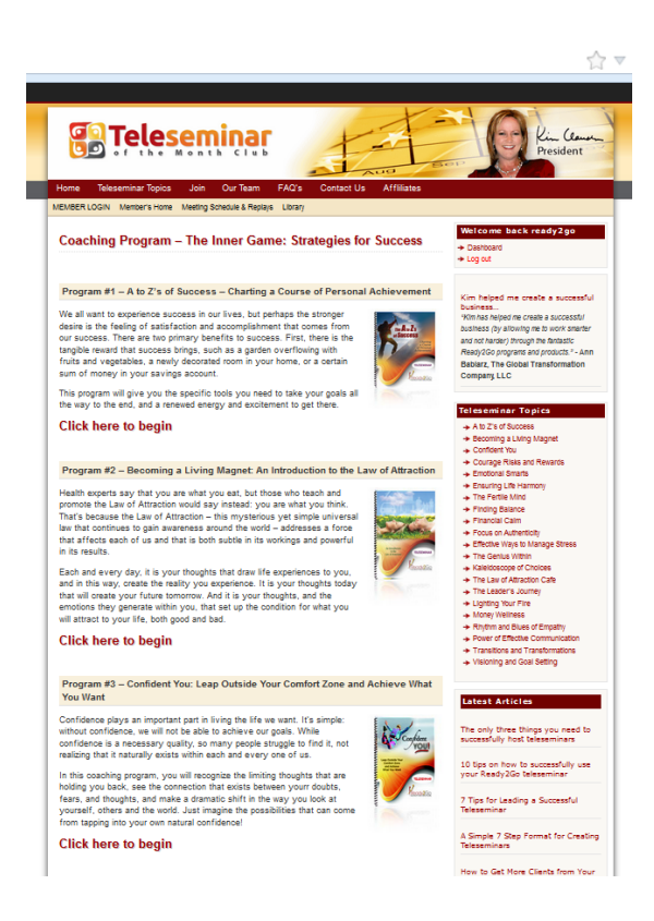
The Genius Within - Calling on Your Natural Talents to Make Life More Fulfilling Self-Study Coaching Program Preview